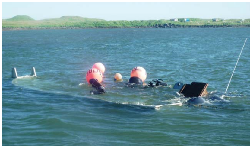
TOP LEFT: The partially submerged skiff rests just off the beach of a small fishing camp. TOP RIGHT: ALEX HALEY Rescue and Assistance Team wade through the shallows that are unable to be passed by small boat. Carrying with them are two portable pumps. BELOW LEFT: The Rescue and Assistance team work through the night to dewater and repair the skiff. Low lighting and changing tides made for slow, but steady work. BELOW RIGHT: The repaired and refloated skiff rests on the beach. Fully functional, the captain and crew of the small fishing skiff are now able to continue fishing and return home safely.